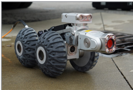
Wheel option for larger pipes