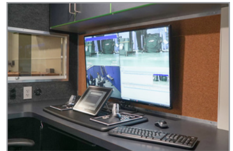
Command station monitors