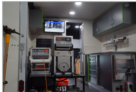
Interior of camera trailer